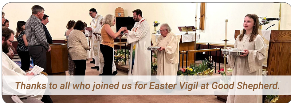
Thanks to all who joined us for Easter Vigil at Good Shepherd.