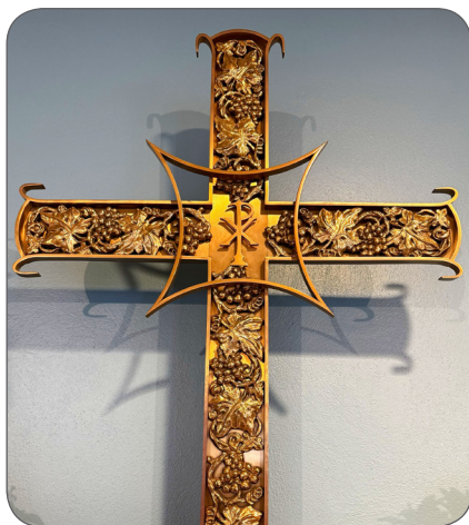
Our chancel cross and Christ the Vine helped inspire our new logo.

There are other symbols too. Imagine walking in to the chapel on Sand Creek Road for the first time: Coming in through the front door, what's the first thing you see? Front and center, behind the altar, is our chancel cross – itself a central symbol that has traveled with us from Central Avenue, linking us to our history .