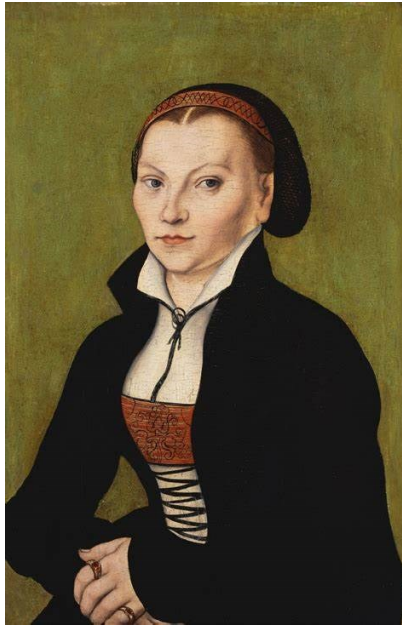
Katharina von Bora Luther painted by Lucas Cranach the Elder