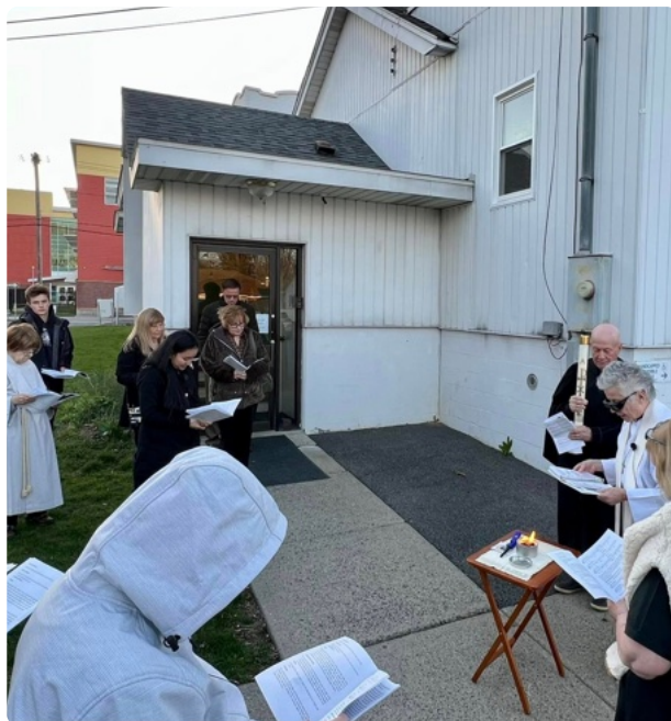
2023 ALT Easter Vigil at Lutheran Church of the Holy Spirit