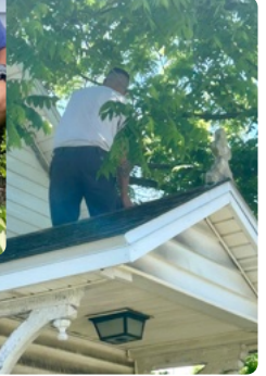
Thanks to our many volunteers for giving the chapel a little TLC on June 2 after worship!